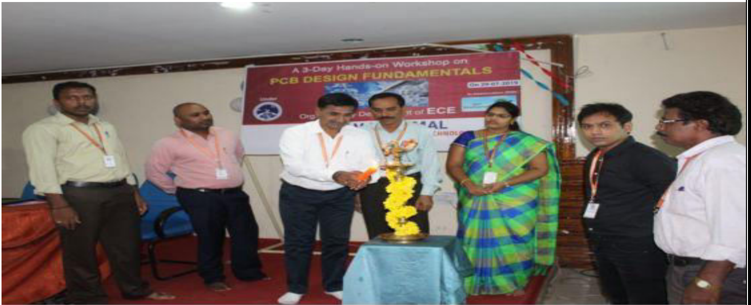
The indispensable and pervasive knowledge of electronic circuits will give the students an insight to their practical approach and also evokes innovative thinking.